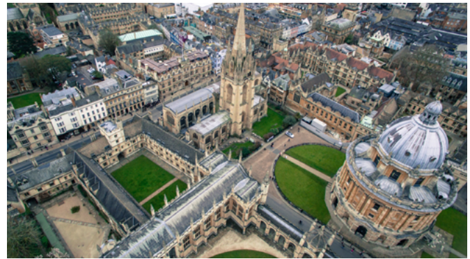
University of Oxford

These sessions will leave you with a fresh understanding of the role of storytelling as a fundamental part of leadership.