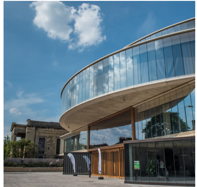
Blavatnik School of Government