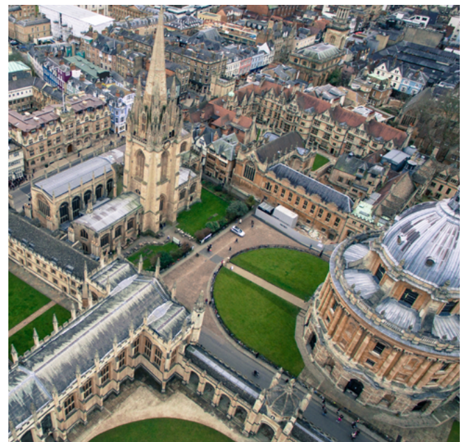
University of Oxford