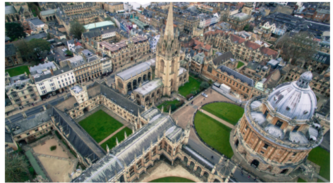
University of Oxford

These sessions will leave you with a fresh understanding of the role of storytelling as a fundamental part of leadership.