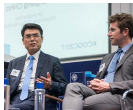
Lord O’Donnell, head of the UK civil service 2005–11; Ana Brnabić, Prime Minister of Serbia; and Shu Yinbiao, chairman of the State Grid Corporation of China; all speaking at the Blavatnik School