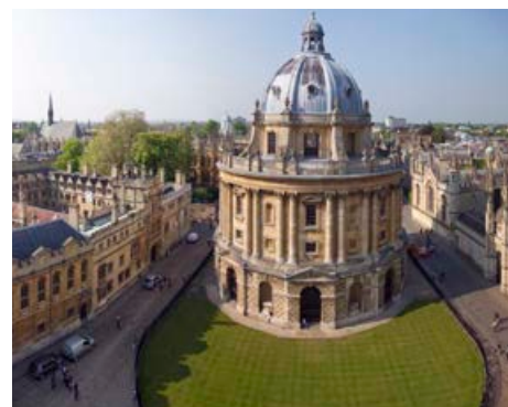
University of Oxford

During the programme you will analyse what determines the design and culture of your organisation and what this means for your approach to leadership. You will assess and improve your people and performance management – including your personal practice. You will also strengthen your ability to navigate the political/public service interface. Taken together, these skills will help you manage change and achieve transformation in your organisation.