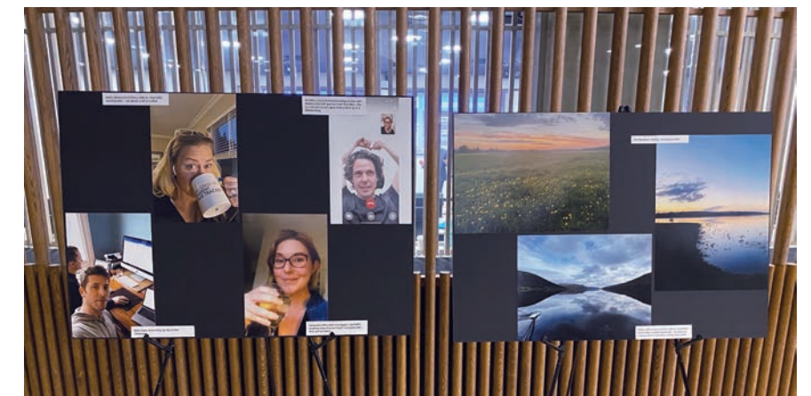
Photo exhibition shows the life behind the curtain for the members of the Oxford Covid-19 Government Response Tracker project