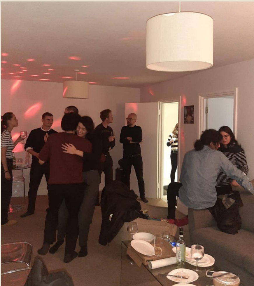
Brazilian MPPs enjoy the first LFP social event