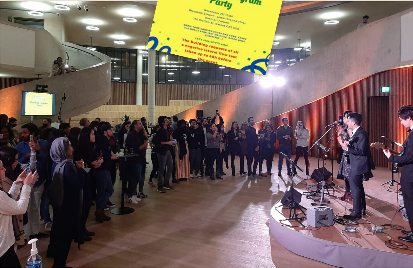
The MPP band plays at the Telegram

As a programme committed to impacting policymaking in the real world, the LFP aims to produce materials that are attuned to a variety of audiences, and that serve multiple educational and professional development objectives